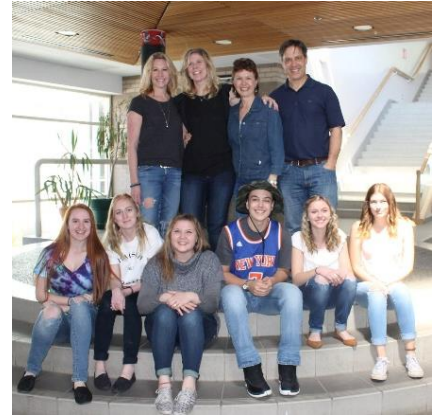
Staff and students celebrate Jeans Day

Are you living with a family member struggling with mental illness? You are not alone. Strengthening Families Together First Nations Edition Program will help. This 10 session group provides information, coping skills and support. Sessions are every Thursday from June 15 to August 10, 1:00 – 4:00 p.m. Participation is free. Registration is required at 778.422.312 or 250.709.2985.