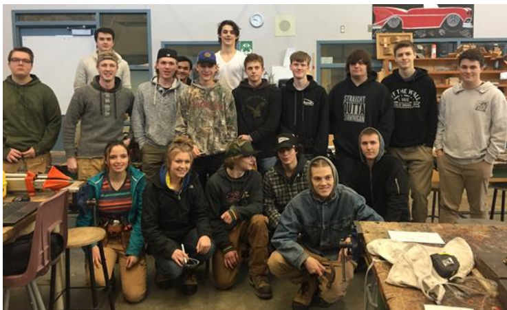
This year's TASK students