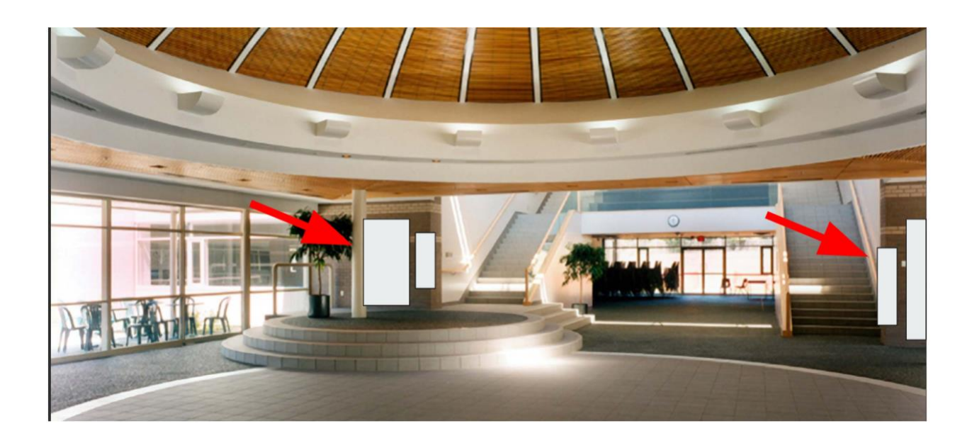
Figure 2. Dome entrance with arrows showing where Dr. Frances O. Kelsey Vignette/Sign #1 and Malahat Nation Vignette/Sign #1 will be installed.