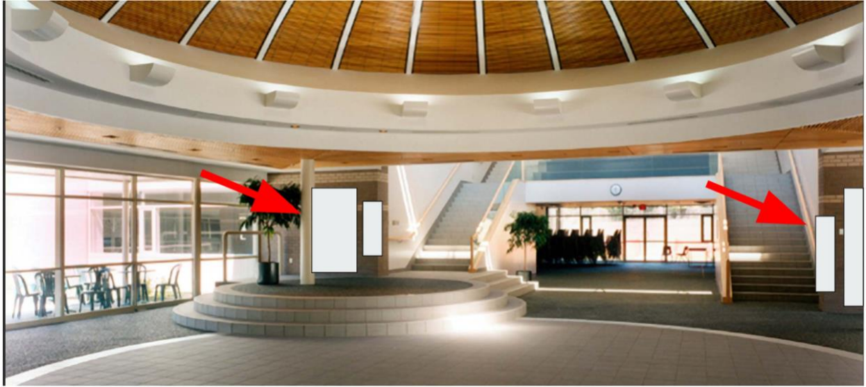
Figure 2. Dome entrance with arrows showing where Dr. Frances O. Kelsey Vignette/Sign #1 and Malahat Nation Vignette/Sign #1 will be installed.